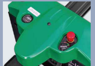
Body feature smooth lines and affluent sense of movement, and compact profile, in accord with the latest appearance design trend