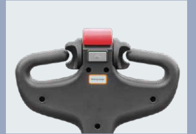
The upright-tiller running function allows it to work within confined space, such as container