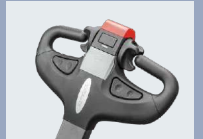
The modular tiller is simple but reliable and beautiful, all parts inside it can be replaced separately and all operations can be done easily with one hand