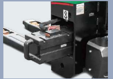
Easy for exchanging battery