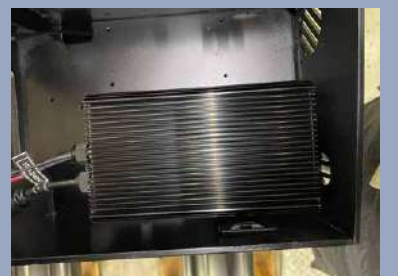
Built-in charger, charging is more convenient